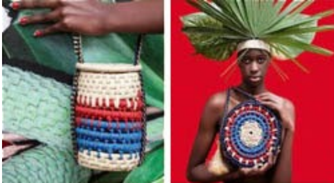
Tubinho Neon Purse / Tambor do Tempo Purse